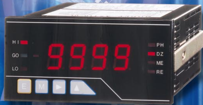
Display single type (A51XX-XX)