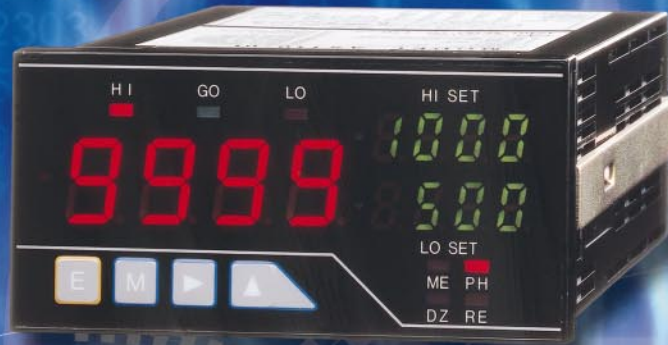
Display multi type (A52XX-XX)